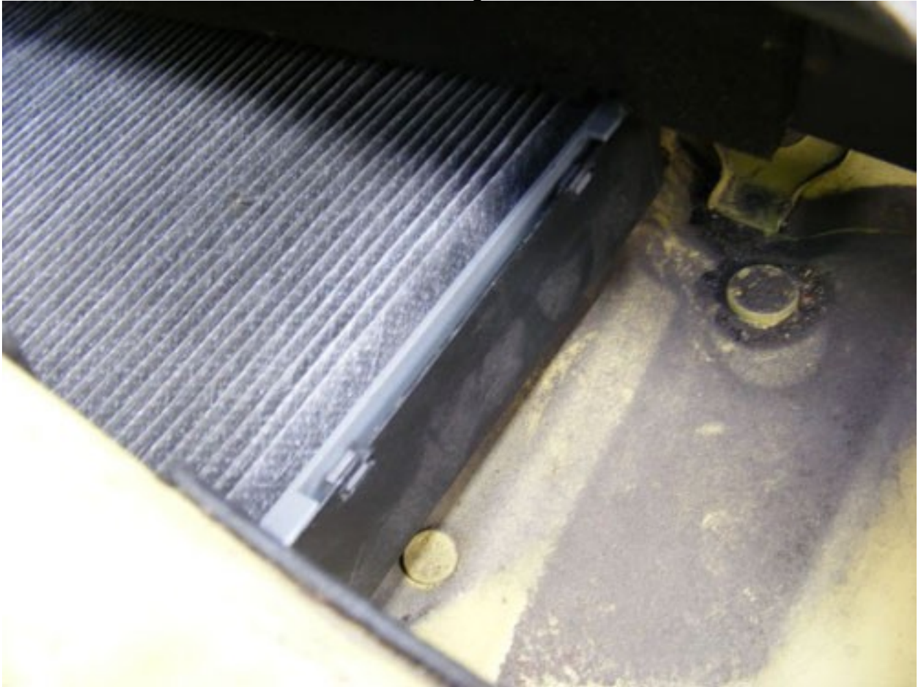
Old filter against the new one:

Note the plastic pegs on the top edge of the filter & the gaps on the housing where the pegs must locate when fitting: